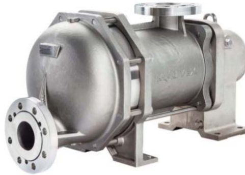
SLC Series Eccentric Disc Pump