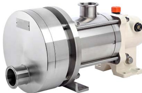
SLS Series Eccentric Disc Pump